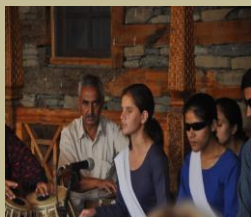
Singing concert by Girls from the Blind School;