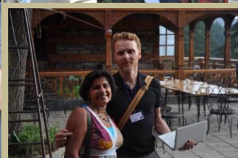
Sharing at the Tea Break