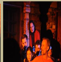
Participants singing Bhajans on Music concert night.