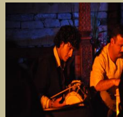
Musicians from Musical concert